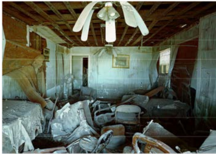
Robert Polidori, "North Robinson Street," C-print, 2005. [38]

In the picture North Robinson Street (Figure 9), the symmetrically hanging ceiling fan, limp like a wilting daisy (echoes of the Kingdome's final resting shape), coupled with the straight-on perspective, creates a soothing tranquility and the imposition of rationality for all the clutter and chaos to live within. The outlines of the room, however devastated and exposed they may be, serve as a frame for what we can't understand, which is reinforced by the frame of the picture itself. These formal scaffolding structures, imposed by Polidori, shape the way we see the devastation from that hurricane. As there is almost nothing within the photograph that serves as a contrast to the destruction and make us feel its oddness, the photographs begin to take on the same mediated effect of the tourist ruin. We develop an archeological and socio-political interest, where we can appreciate the lives of the people who lived there, the clues to how they lived, and become angry at the government response at the time, but are harder-pressed to extrapolate the image to our own homes and our own lives. It's as if with temporal familiarity we need the contrast of regular everyday living to have the ruin affect us, whereas with temporal distance, the contrast with our modern selves only reinforces our feelings of detached observance.