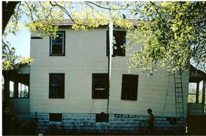
Gordon Matta-Clark, Splitting: Four Corners . (322 Humphrey Street, Englewood, NJ), 1974 [37]