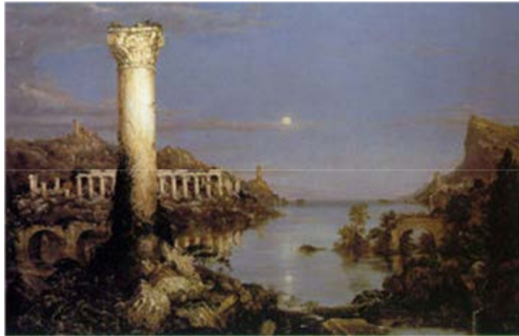
Thomas Cole, The Course of Empire (Desolation) , oil on canvas, 1834-1836. [33]

(Collection of The New-York Historical Society, Accession #1858.5)