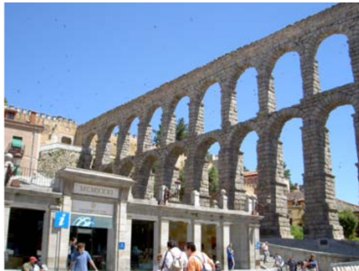
Roman aqueducts and tourism office, Segovia, Spain, 2006.

Our ongoing struggle with time, the elements, nature, and each other all become crystallized in the remains of buildings and structures that were made to support and give meaning to another culture's best efforts at the time. These days, to maintain a ruin from antiquity takes a lot of work and resources. In 2008, The New York Times ran a brief article on the ruins of Pompeii, which stated, "The Italian government declared a year-long state of emergency at Pompeii on Friday to try to rescue one of the world's most important cultural treasures from decades of neglect....Some 2.5 million tourists visit Pompeii each year, and many have expressed shock at the conditions." [6] The research needs of archeologists and historians aside, the fact that a ruin, by definition a neglected, destroyed object, can suffer from too much neglect so that people who came explicitly to see a ruin would be shocked, is a strange development. There