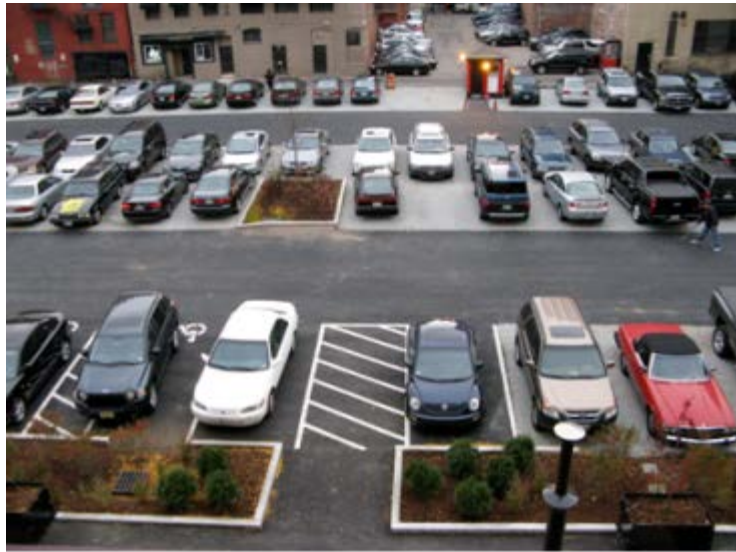
Fancy landscaped parking lot next to RISD Studios, Providence, RI, 2008. (Gabriela Salazar)

Most distressing is when the now-empty lot is not filled, when the ghost image of the former structure can be seen on the adjacent building's wall and the bone-like rubble is left to line the ground, such as the lot on the other side of Fletcher (Figure 4). In this instance, we are not reassured or allowed to put a frame around the ruin; instead, we are fearful at its implication. Like a missing tooth, we notice the absence and don't get used to it because the function of our teeth, to chew and to look good or, in the case of a building, to house our activities and to help maintain the function and feel of the city, is compromised. [22]