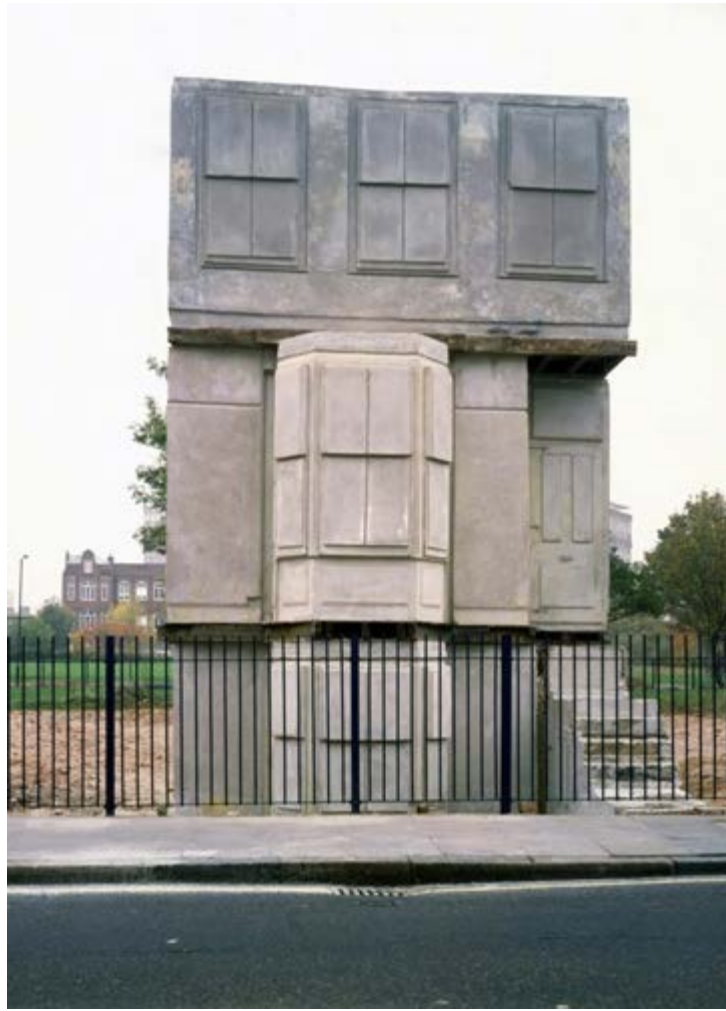
Rachel Whiteread, House , concrete and existing structure, 1993 (now destroyed). [36](© Rachel Whiteread. Courtesy of Gagolian Gallery. Photo credit: Sue Omerod.)

Every interior wall was lined with concrete before the exterior walls were stripped away, leaving a mysterious ghost impression of the inside of the room facing out from between the floors. In the inversion, all of the familiar forms—fireplaces, windows, doorknobs, and architectural moldings—become strange to us, as the holes they left behind protrude oddly outward or inward, in opposition to what we expect. Also unnerving is the sheer bulk of those empty spaces. They make us feel the space outside the house as inside, and give a weight and urgency to the voids left by the people who inhabited the house. Because of the use of concrete, the structure feels of our contemporary landscape. (Who knew that every Victorian house held Modernist cubes inside?) The new concrete walls are a bulwark against further destruction, a self-preserving gesture as well as a monument to a street that had already been leveled. House is an entombed contemporary ruin, poised between exposure and complete opacity, in the process of simultaneous construction and destruction. It represents a new kind of dissolution for our culture, not the slow process of decay that makes the new old, but the surrender of the old to the new. Reflecting on the process of urban renewal, especially of the 1960s and 70s, House speaks to the temptation to scrap older structures, and the intimate but conflicting histories that go with them, for new narratives, a clean slate.