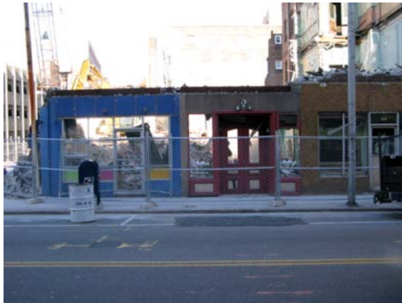
All pictures, demolition of Talk of the Town, 2008.

As has been noted since Romanticism, experiencing ruins subsequently alters the way we feel about our built environment. As an entire city grows and shrinks, like the stones of one big ruin being worn away, reconstituted, and grown over, our spatial experience of the street and our landscape becomes more responsive to how these holes and vacancies affect the whole order. Each crushed bedroom and every hole in the streetscape has a narrative, and each is its own anonymous sacrifice to more powerful forces.