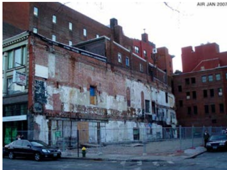
Remains of DOWNCITY DINER fire, other side of RISD Studios, Providence, RI. [34]

Also, when a familiar building is taken down, we often become aware of our environment as if experiencing it afresh; the loss makes us sensitive to what surrounds it. To be an emotionally powerful experience, these ruins do not need to be important feats of engineering or emblematic of our society in their original forms, only familiar to us and part of what gives our surroundings a sense of place. At the sight of a decades-old abandoned industrial structure in her neighborhood being torn down, one