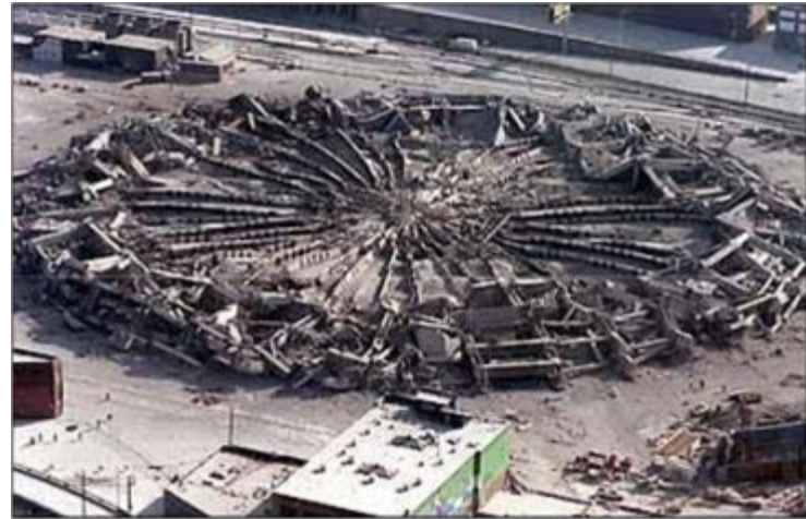
Pedro Perez © The Seattle Times

Seattle Kingdome, Seattle, WA, after implosion.[35]