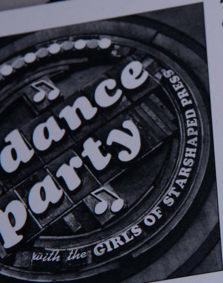
Printed with modular metal type & rule, proving even squares are hip! ..... set in Cooper Black

The term 'girl' has a host of negative connotations; it sounds condescending to any woman who's done her share of living in the adult world.