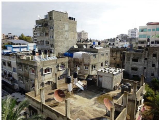
Figure 8. Repetitive use of building products and components in Gaza.

In this visual analytical study, I discussed some of the minimalist characteristics of buildings and architectural forms and components in the Gaza Strip. Nevertheless, it should equally be remembered that the existing aesthetic quality is also a result of the economic and political state of affairs. At the same time, buildings emerge as responses to their physical surroundings. This is so obvious in the plan of residential buildings in the Gaza Strip, which took many of its cues from the existing structures on the plots.