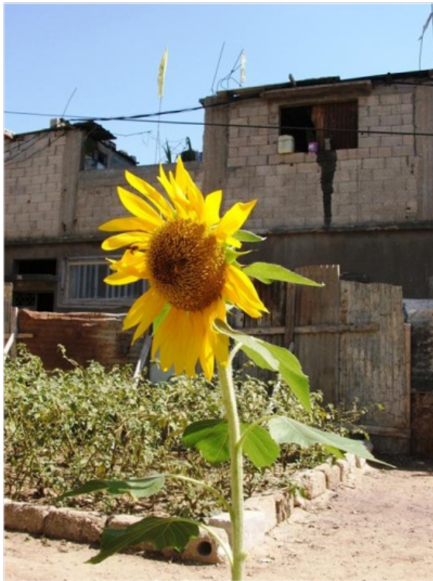
Figure 10. A powerful dichotomy of the richness of imagery and the simplicity of the things surrounding people in the actual space in Gaza.

Salem Al Qudwa elqudwa@hotmail.com , 14098658@brookes.ac.uk