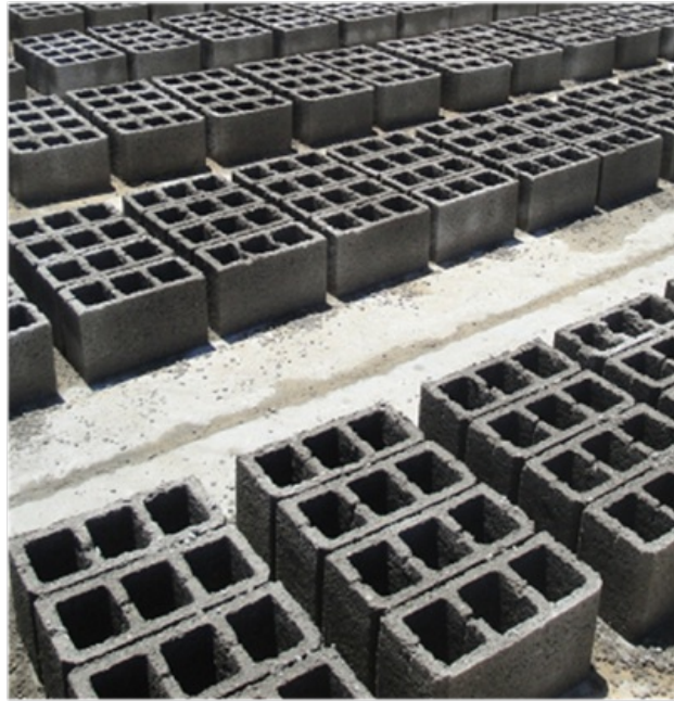
Figure 2. Hollow concrete blocks with which local work crews in the Gaza Strip are well versed.

commonsense logic and the rationale of local place-making. [7] And while the architectural project is generally understood to bring about order in space, order and rhythm in the Gaza Strip may not, at first, appear to inform the quality of building work, or may not be easily discernible. Nevertheless, it could be argued that in spite of structures being traditionally built with the local knowledge and the few trades available, buildings in Gaza are no less poetic than those resulting from an orderly and detailed planning process.