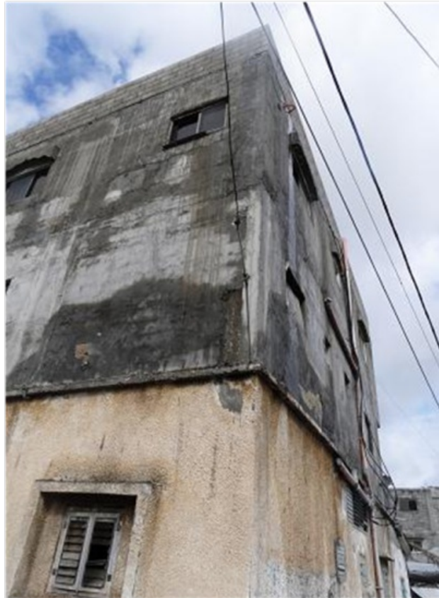
Figure 1. A typical self-built house in the Gaza Strip where forms are mainly dictated by needs of the occupants. Building without architects is a common practice in Gaza, where good and low-skilled workers regularly undertake work towards maintaining the quality of buildings while almost all poor houses go without plastering their outside or, often, even inside walls.

In Gaza, nowadays, the lack of urban and regional planning and property management is a critical issue. Building licenses are granted liberally, existing land use regulations are often ignored, and the Strip lacks experience with planning mechanisms, in general. At the same time, the population is increasing while the available land is decreasing. Building forms and spatial relations are dictated by the lifestyle of extended families and the needs of the occupants (Figure 1), rather than by the intended composition of a designer, if there is a designer at all! As for the role of the architect, until the late 1980s, the architect did not necessarily have to be involved in the design process, and the building process itself could be approved even without the architect's signature. [6]