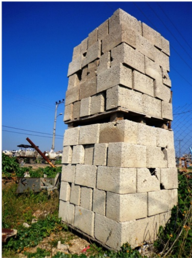
Figure 7. Static and self-standing minimalist objects in a dirty urban environment of Gaza.