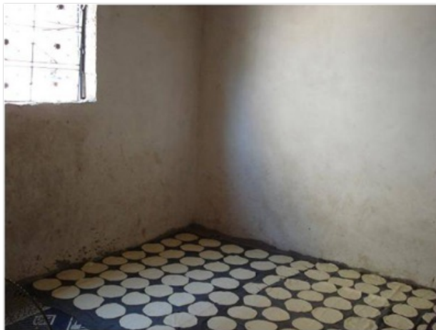
Figure 4. Dough circles repeated in rows and columns, as they were prepared by a poor woman inside an empty room, in the Gaza Strip.

Another example is that of ordinary Palestinian women in the Gaza Strip, who are accustomed to preparing traditional flat bread for their families, using wheat flour received from humanitarian aid agencies. Baking bread at home saves hundreds of shekels on groceries every year. Freshly-baked bread is prepared every day at some houses. Similar to the basic arrangements of minimal art shapes, women lay clean circular surfaces of dough and repeat the pieces of dough in rows and columns (Figure 4).