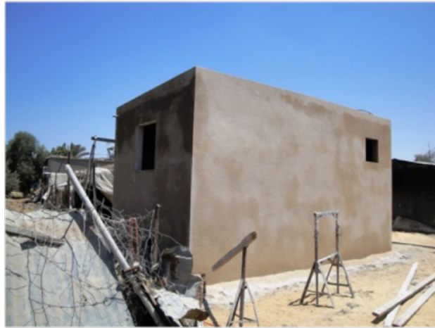
Figure 9. Approaching the real cube: a simple brick and concrete structure in Gaza that has the power of minimalist work, while meeting local needs and budgets.

equally, that, with regard to the basic cubic forms, humans naturally tend to build cubic forms. Examples of architectural abstraction can also be easily seen in the streets of the Strip (Figure 9). At the same time, the gray color of concrete can be noticed while moving through the city roads and neighborhoods. And while gray might be the first image that comes to mind when we think of concrete, this can also add an element of style, of raw beauty, to buildings.