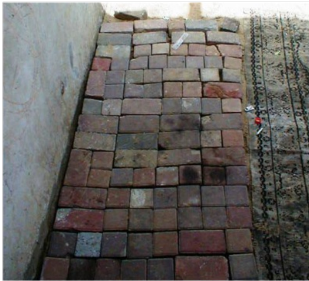
Figure 3. Similar to the grid formats of minimalist artist Carl Andre, a local had arranged bricks in a particular manner.

From this point of view, residential buildings in the Gaza Strip may look like disorganized groups of gray concrete boxes crowded together. However, if you look beyond these outer layers and begin to examine everything that goes on underneath them, you find that a complex web of human life-support systems is at work in these dwellings. [10] In a manner that is convergent with minimalist art, though not necessarily directly informed by it, place- and space-making techniques in Gaza display resourcefulness, not hopelessness.