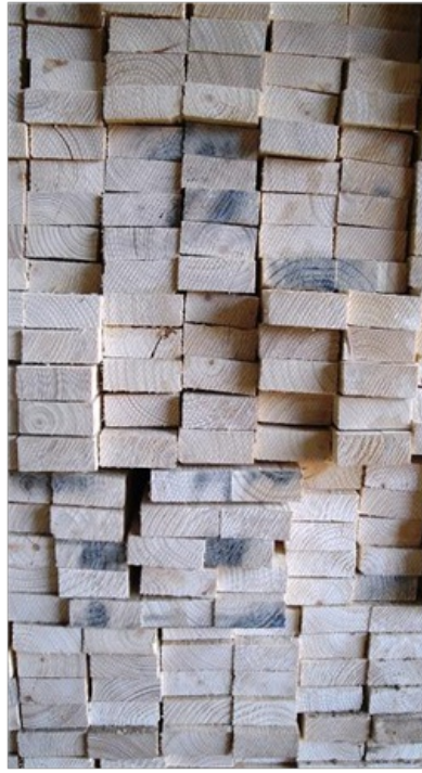
Figure 6. Stacks of construction materials.

The aesthetics of raw materials, the relationship of objects to the actual space, the effects of natural light on street volumes, these are all available features within the visual context of the Gaza Strip, producing highly reduced arrangements. Following these basic principles, local minimal art sculptures were primarily made from industrial materials, such as natural stone, wood, concrete, steel, aluminum, glass, and plastic. These objects, frequently reduced to very simple geometric shapes, were industrially produced, thus removing the artist's personal signature from the work. The works were also characterized by serial arrangements of a number of shapes in small and medium dimensions. In a similar display but lacking an intended artistic concern, freestanding objects, such as metallic tubes and wooden stacks, can currently be seen lying in the streets of the Gaza Strip, with their circular and rectangular ends being repeated in horizontal and vertical linear patterns (Figure 6). Wood pallets, stacks of plywood, and rusty tubes appear as highly similar to the sculptural works of minimal art, with their focus on the formal aspects of composition. While watching the blacksmith at his workshop working the metal with a hammer and anvil, or the carpenter working at his wood parts, one can see that they are also making pieces of sculpture, keeping the process simple, in addition to cheap and affordable.