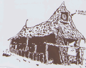
A GABLE MASK!

AND THE GABLE MASK WOULD HAVE HUNG ON THE OUTSIDE OF AN IATMUL MEN'S HOUSE ABOVE THE ENTRANCE.