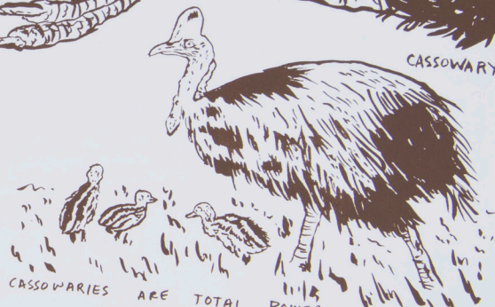
CASSOWARIES ARE TOTAL POWER CREATURES!