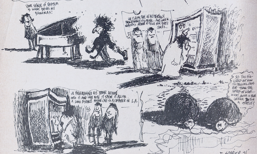
FIG. 3 TURTLEPILLAR

PRINTED BY THE RIP-OFF PRESS... BOX 14158, SAN FRANCISCO, CALIF. 94114 "BALLOON VENDOR COMIX" IS AN "OVERLAND VEGETABLE STAGECOACH" PRODUCTION... © 1971... 42 HUMBOLDT AVE, SAN ANSELMO, CALIF. 94960... GRAPHIC EXPENTIONS, PERCEPTUAL FREEFALL... VISUAL REPAIRS AND RESCUE SERVICE... CULTURAL FEEDBACK... WITH A WRITTEN REQUEST AND OUR CONSENT YOU CAN PROBABLY RIP OFF THIS MATERIAL... COPYRIGHT © 1971 BY FRED SCHRIER