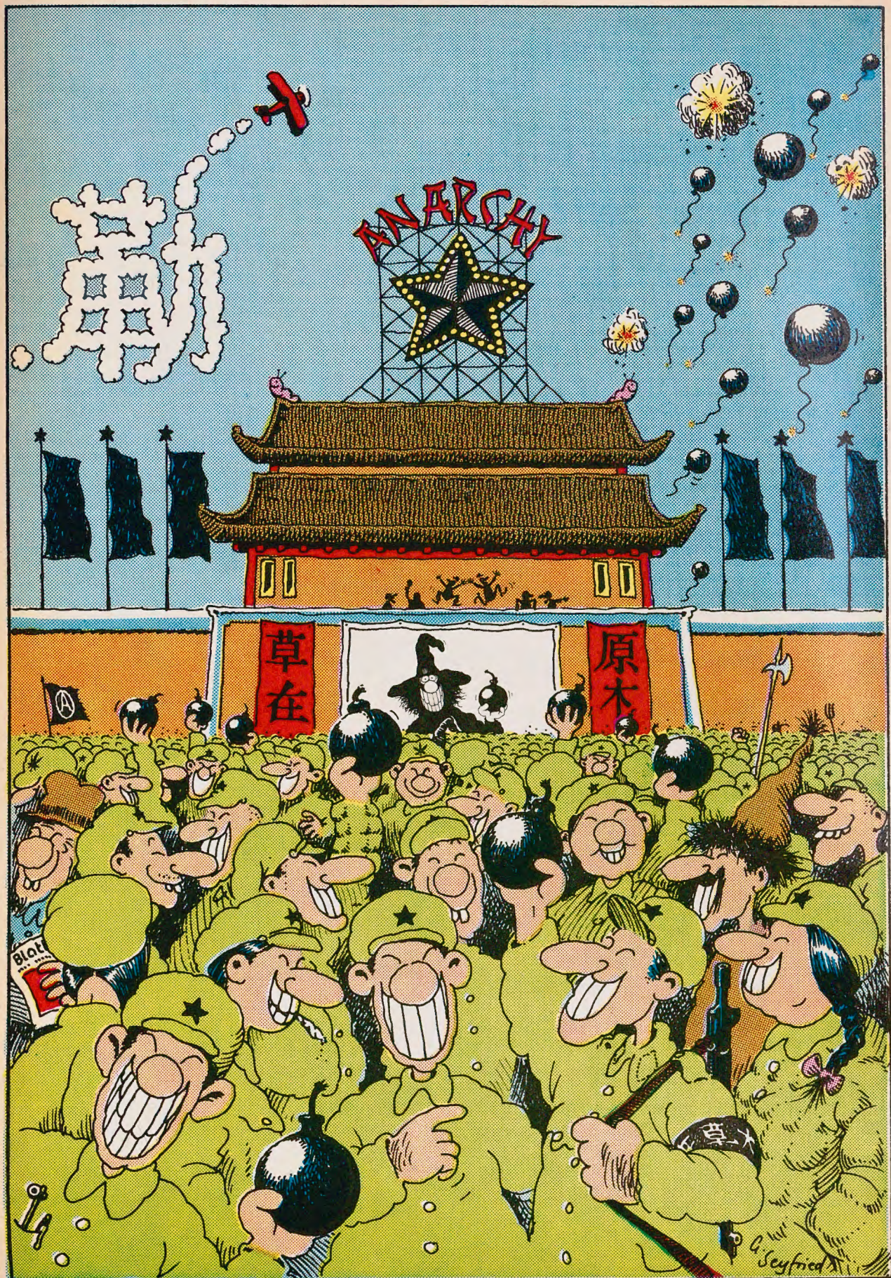
EXCLUSIVE ON-THE-SPOT SKETCH OF MASS ANARCHIST DEMONSTRATION IN TIEN AN MEN SQUARE IN PEKING.