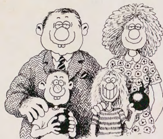
ACTUAL ANARCHISTS IN REAL LIFE.

OF THE WORK IN THIS ISSUE HAS BEEN INSPIRED BY—OR BASED ON—ANARCHIST IDEAS AND HISTORY. AS IT BECOMES INCREASING CLEAR THAT THE REAL TERRORISTS ARE NOT A FEW ISOLATED LEFTISTS BUT ARE THE GOVERNMENTS AND CORPORATIONS OF THIS WORLD WHO HOLD US HOSTAGE WITH THEIR ARMAMENTS, MILITARIES & INTELLIGENCE ACTIVITIES, ANARCHISM BECOMES MORE & MORE RELEVANT!