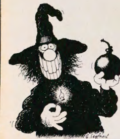
POPULAR MISCONCEPTION OF TYPICAL ANARCHIST

AND NOW FOR A FEW WORDS FROM THE EDITOR: THIS COMIC BEGAN AS A WHIMSICAL IDEA A YEAR AGO—BUT AS THE IDEA CAUGHT FIRE IT HAS COME TOGETHER AMAZINGLY FAST. ALL