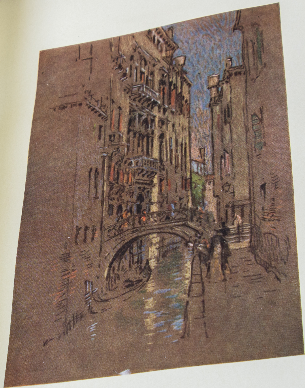
PALAZZO MONCENIGO, VENICE.

ITALIAN MUSEUM most the happy valley of its golden meadows under a blue sky over its romantic landscape these scenes of water it is the only part of Venice that is not a part of the city — the water is the water with them — the water is the water which is to be seen in the These are persons who hold this view of perspective, in which, with its immense can, the houses have infinite variety, the for it is not tall, we imagine, the houses the address of the three Mercantile palaces which is not shown at which he goes the for after centuries it is sufficiently evident creation of the Palazzo Loredan, but a the Museum, not to speak of a variety of bits whose beauty still has a degree of most striking relics of early Venice are the prettily clustered — peeping out of places than the sea. As we approach the the tide off and a comparative extension is a wide paved walk on either side of the entrance — and who in Venice is not a to walk about. I speak of the summer our Venice that is the visible Venice. The down the fondamenta, and the long faded blue cotton, lie asleep on the no colour anywhere else there would be [ 64 ]