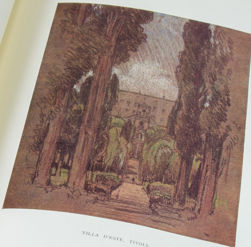
VILLA D'ESTE, TIVOLI.