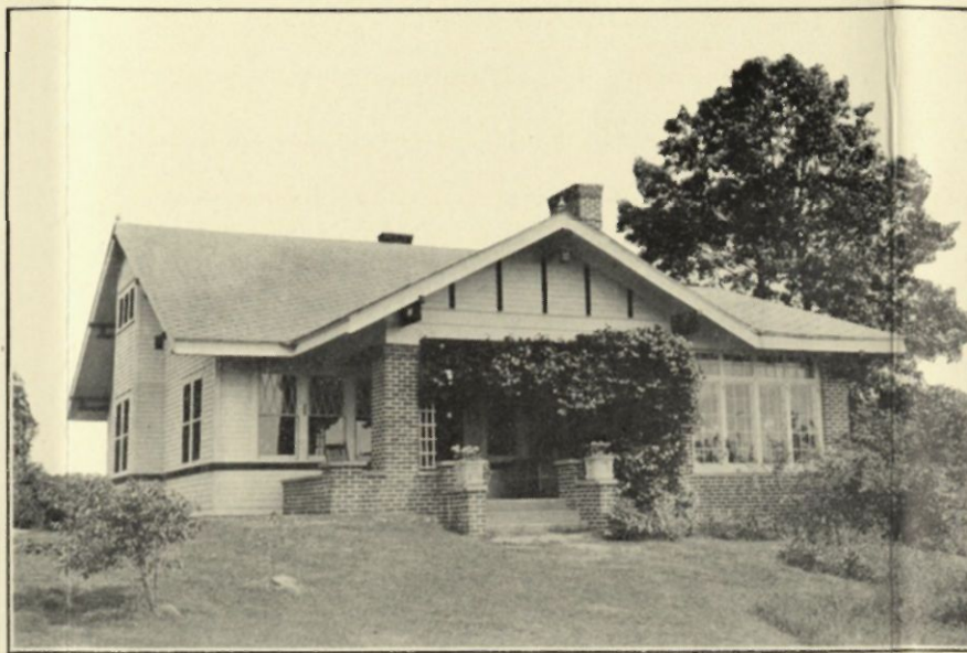
WATCHAUG POND, KIMBALL BIRD SANCTUARY