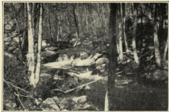
TURKEY MEADOW BROOK