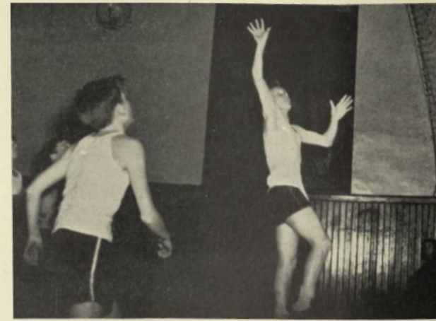
BASKETBALL GAME AT THE GUILD

If you should step into its halls at nine in the morning you would see every room occupied with groups of seventh grade, eighth grade and High School boys and girls busy in modern foods, clothing and woodworking laboratories, taught and directed by a staff of trained specialists. Its attractive Social Room is the meeting place of young people before and after classes.