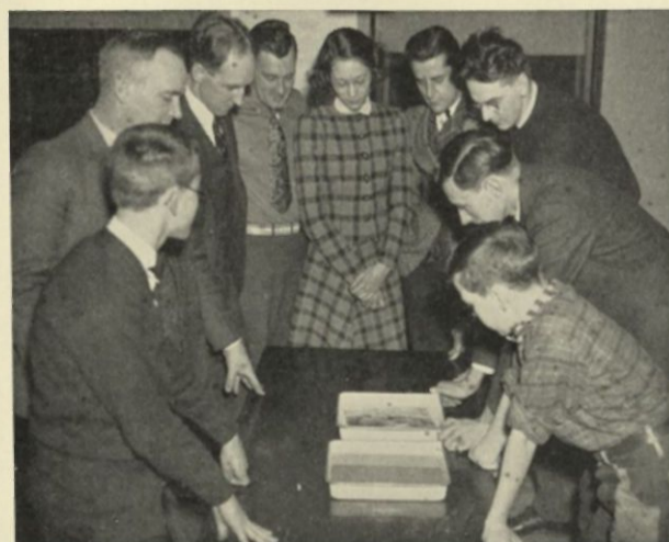
PHOTOGRAPHY CLASS TONING PRINT

Photography, stamp collecting, travel clubs, dramatics, marionettes, handicrafts are offered, and tap