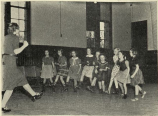
TAP DANCING CLASS AT THE GUILD