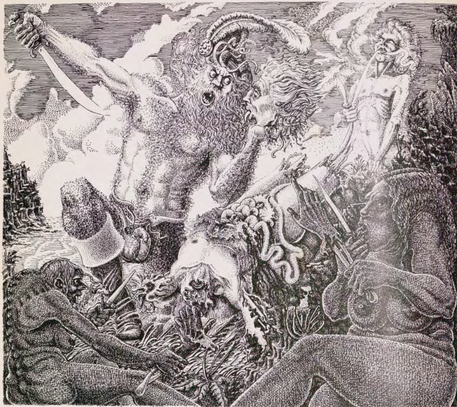
SAWNEY BEANE ca. 1390—1437

At twenty, Sawney Beane could no longer bear the simple constraints of civil Scotch society and fled Edinburgh in the company of a churlish woman to the desolate coast of Galloway. There they remained for twenty-five years, apart from the company and knowledge of their fellow man. Over the years, their carnal grunts spewed forth a brutish band of whelps whose incestuous ranks quickly reached clanish proportions. The barbarous crew supported themselves by preying on travelers of the coastal roads near their abode. All who passed were murdered, slaughtered, and eaten. Fate finally provided a survivor whose grisly tale caused the outraged King of Scotland to lead on immediate search of the caverns dotting the coast of Galloway. The entire Beane clan was taken by surprise in a foetid cave hung with the salted torsos and limbs of recent victims. Taken to Edinburgh and there condemned for the murder of over a thousand, the clansmen suffered slow dismemberment by blunt saws while the women and children were put to the torch. All died unrepentant, shouting obscene curses at the gathered throng.