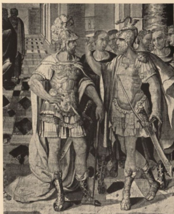
"THE ROMAN SENATORS"