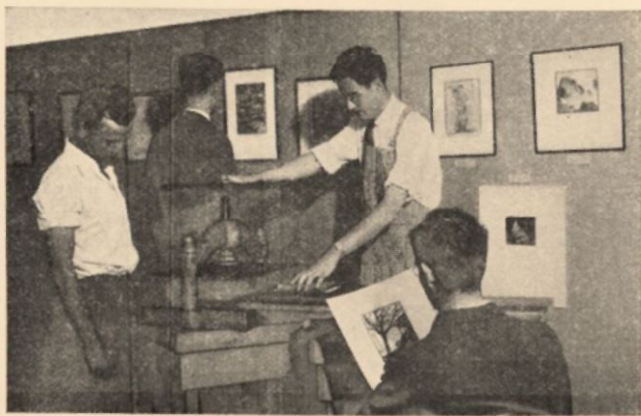
A block-printing demonstration in one of the improvised galleries

But statistics do not tell the whole story. The students in charge of the truck remarked about the interest the prints of the second exhibition held for the many textile engravers of the state. There is the happy picture of a farm truck that drove up to one of the improvised galleries with an entire family, some in the driver's cab, some seated on boxes in the back. During the first exhibition in Tiverton, plans were laid for converting a Vacation School, about to disband, into an art class for children. When the second exhibition reached Tiverton, the work of the class was shown along with the pictures from the Caravan. It appears, moreover, that the Federal Government is contemplating the use of trucks for travelling art exhibitions in connection with the Federal Art Project, and Mr. Bright has gone to Washington to discuss his experiences of the summer with the Director.