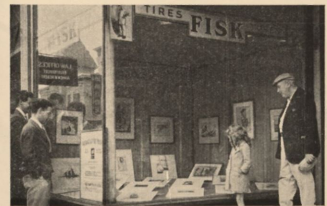
Part of the Print Exhibition in the window of a vacant store used as an art gallery

home. There is a demand for exhibitions of art for children. The possibility of circulating artistic and historical exhibitions in connection with the Tercentenary Celebration in Rhode Island is being seriously considered. And it is perhaps not too much to hope that the experiment with the Art Caravan may eventually lead to the establishment of a series of at least semi-permanent Art Centers through the state. If the interest of public-spirited groups in various communities should warrant the planning of such centers, they could readily be supplied with exhibitions from some central source. Suggestions for continuing the experiment will be received by the Secretary of the Community Art Project, 44 Benevolent Street, Providence. Specific plans will be announced later, but the future of the experiment will rest to an important extent with those groups in the state who may feel that a program of exhibitions and demonstrations will be an addition to the life of their communities.