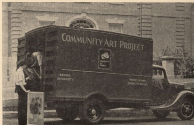
THE ART CARAVAN

color reproductions, to masters whose names are landmarks in the history of painting. Gallery walls were carried in the truck, in the form of portable screens especially designed for use under a variety of conditions, and a grange hall, a school building, libraries, a parish house, and a vacant store were thus converted into temporary art galleries. The itinerary for the first exhibition, shown in each community from two to four days, included Westerly, Hope Valley, Phenix, Tiverton,