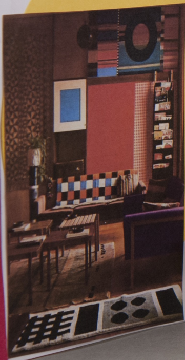
Sottsass apartment Milan, 1969