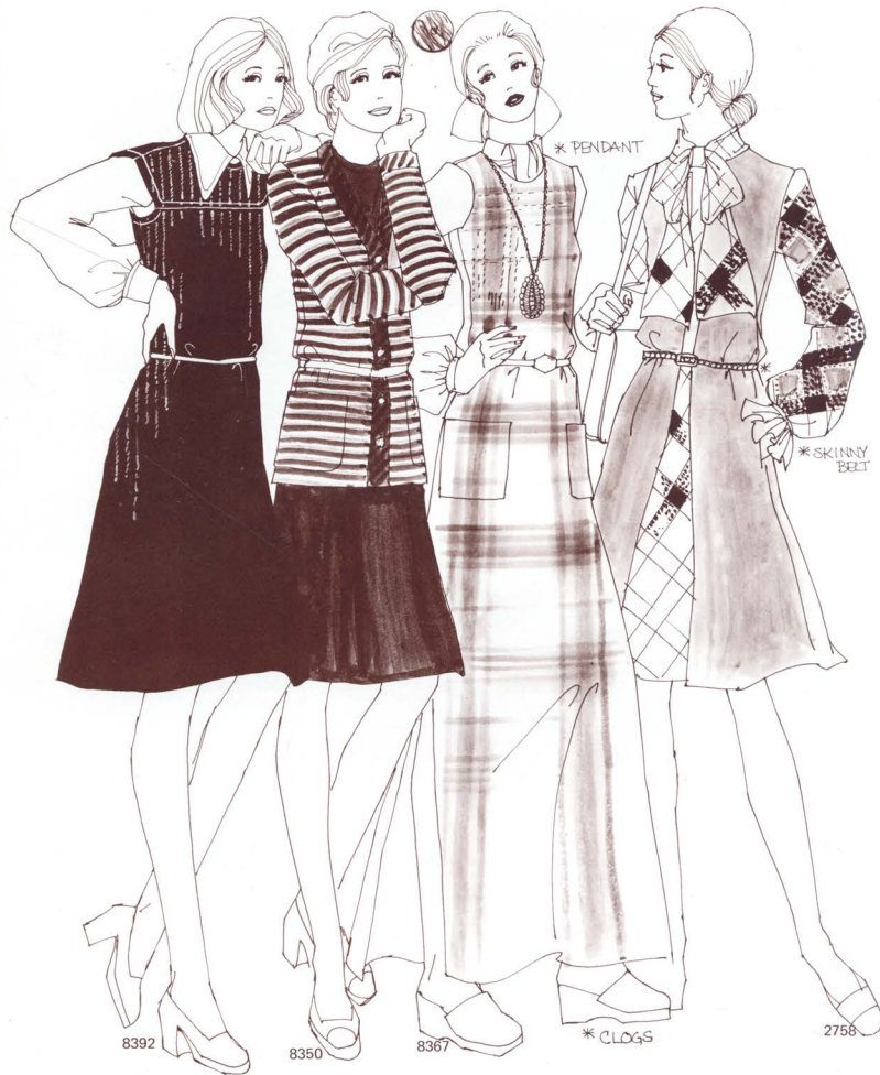
Fall '72 Fashion points