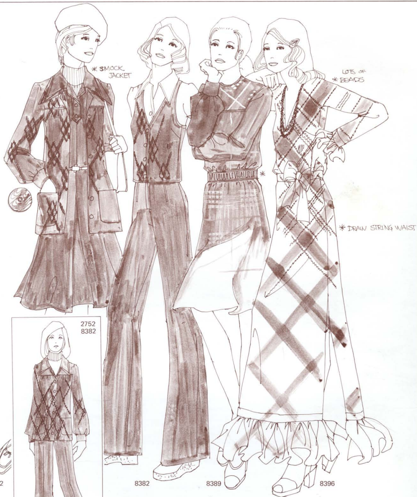
Fall '72 Fashion points